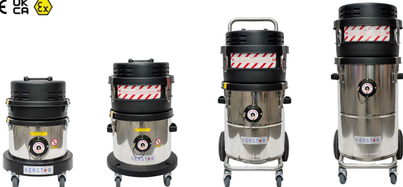
KAV 15H, 20H, 30H and 45H